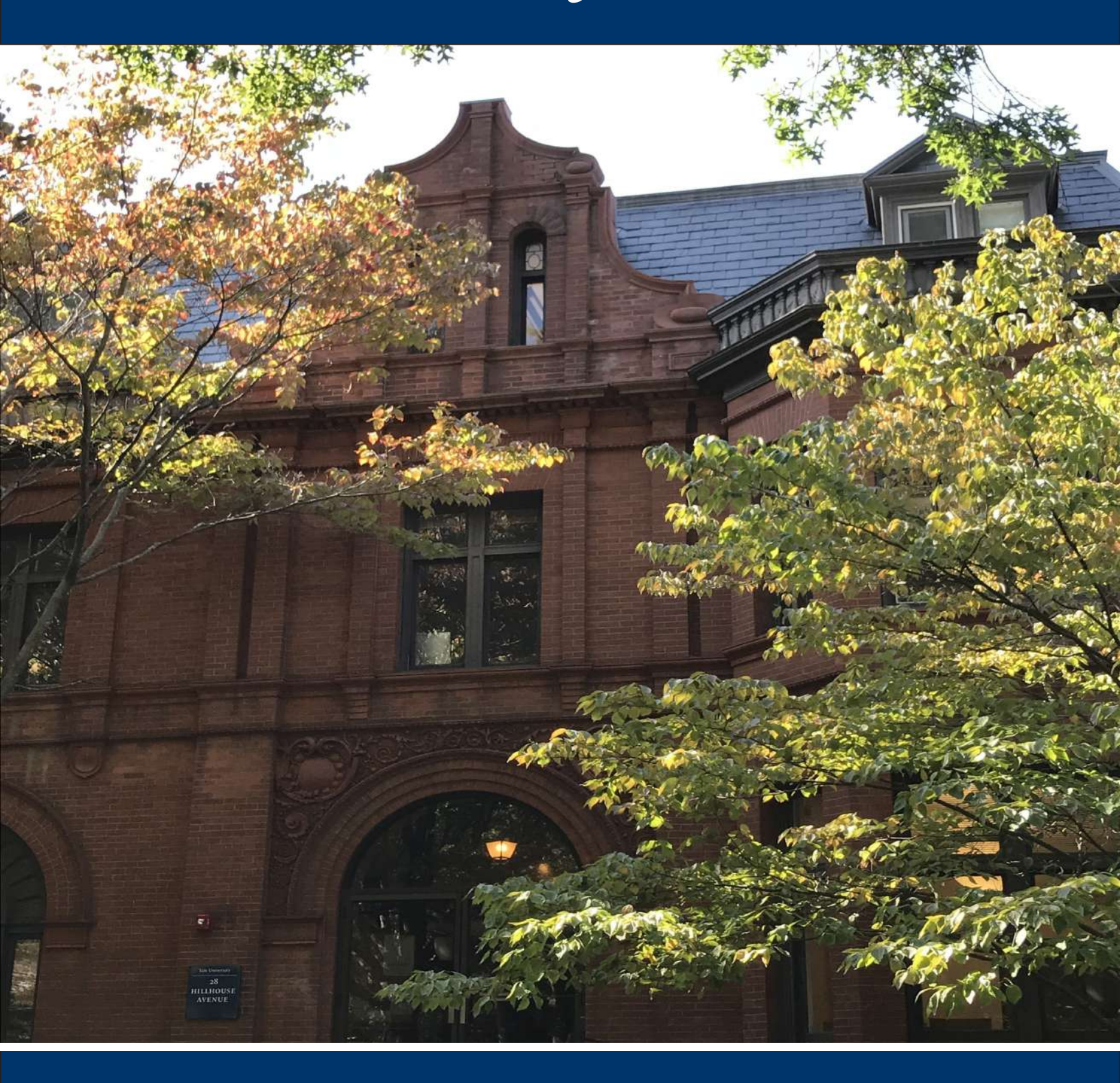
Fall 2017 Newsletter • Volume 2, Issue 1