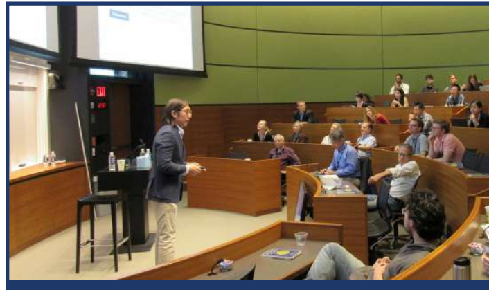
Cowles Summer Conference Series 2017

I would like to mention the Cowles postdoc program. We have expanded this program, now bringing about eight new Ph.D.'s each year to Cowles for year-long postdoctoral positions that allow them to develop their research programs. Our goal here is to bring the most talented new Ph.D.'s in the market each year to Cowles.